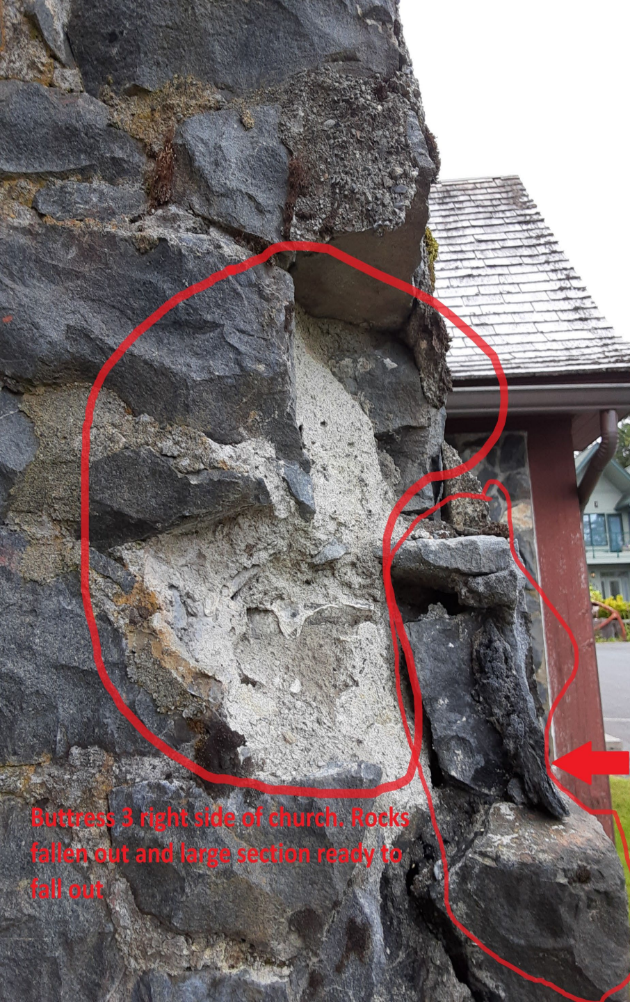
Buttress 3 right side of church. Rocks fallen out and large section ready to fall out