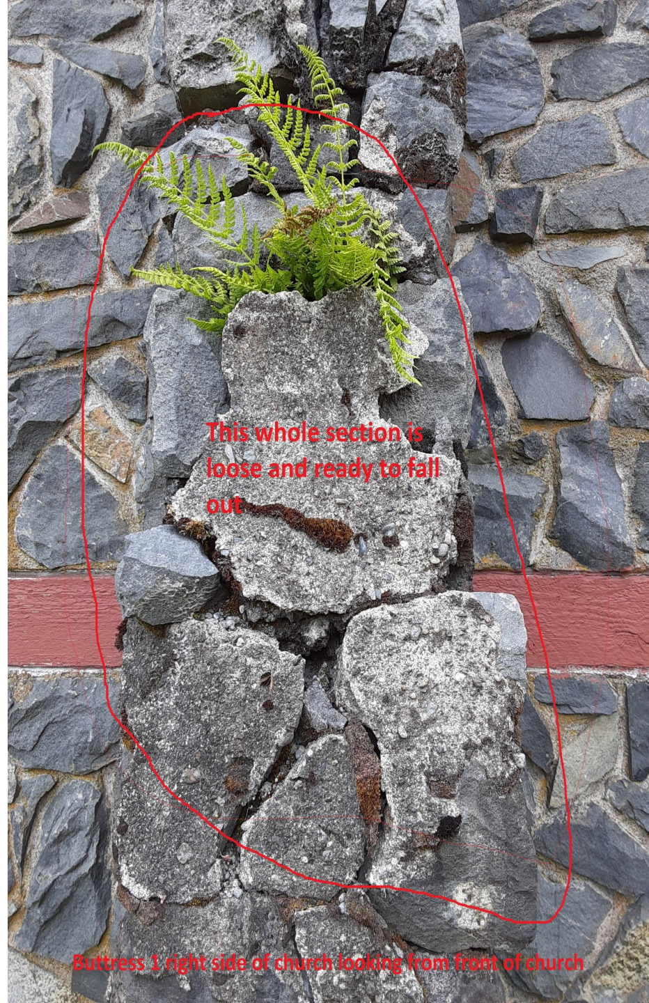
This whole section is loose and ready to fall out